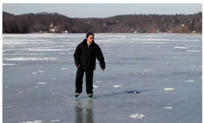
This is my daughter ice skating on Lake Carmel.

Mr. Sinegal there is something now threatening our way of life. The quiet of this country town, the clean air, the low crime and the overall quality of life is about to change for the worse. I am afraid that you, Mr. Sinegal play