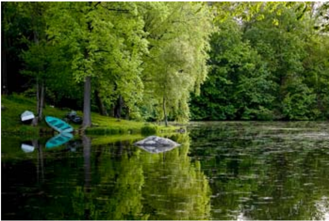
This is Lake Carmel in early spring after a rain