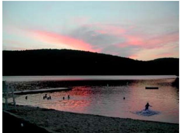
This is our children enjoying the lake on the longest day of the year as the sun set.

A good number of the families who now live here, moved here from the areas south; Westchester, The Bronx and Rockland. They came to Lake Carmel in hopes of a better quality of life for their families. That is also the reason I moved here. I wanted a place where my daughter could have fond memories of her childhood. A place where fresh air and opportunities to enjoy a beautiful lake surrounding will enhance her memories and give her the childhood she deserves.