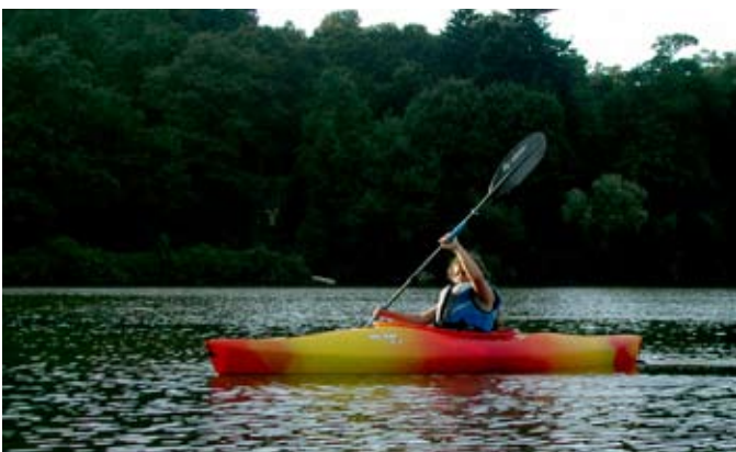
This is my daughter kayaking on Lake Carmel.

A good number of the families who now live here, moved here from the areas south; Westchester, The Bronx and Rockland. They came to Lake Carmel in hopes of a better quality of life for their families. That is also the reason I moved here. I wanted a place where my daughter could have fond memories of her childhood. A place where fresh air and opportunities to enjoy a beautiful lake surrounding will enhance her memories and give her the childhood she deserves.